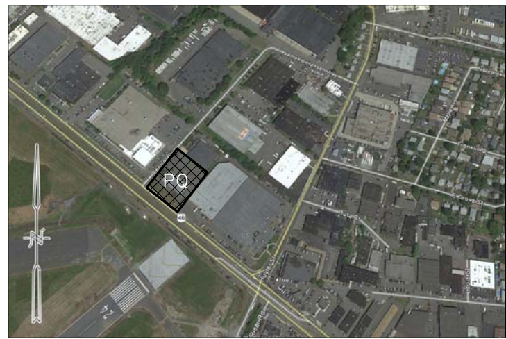
SATELLITE VIEW Not to Scale